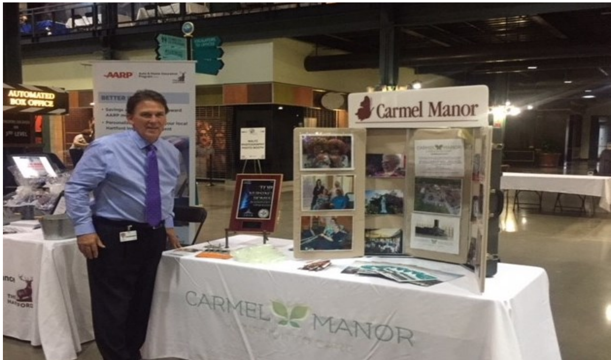
SENIOR EXPO 2018 - NEWPORT ON THE LEVEE