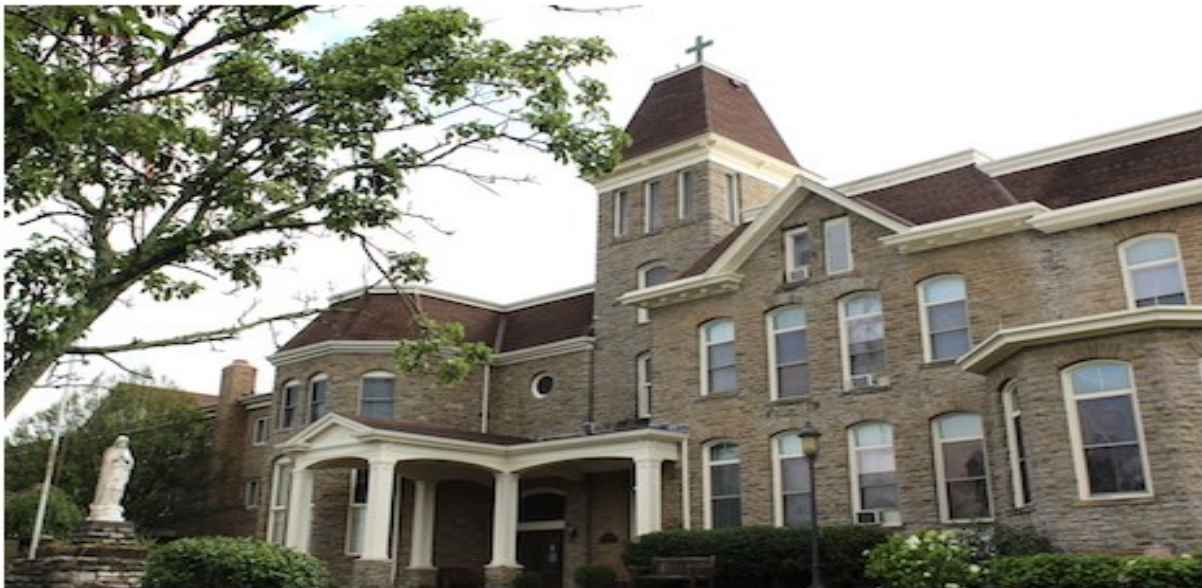
Carmel Manor Main Entrance