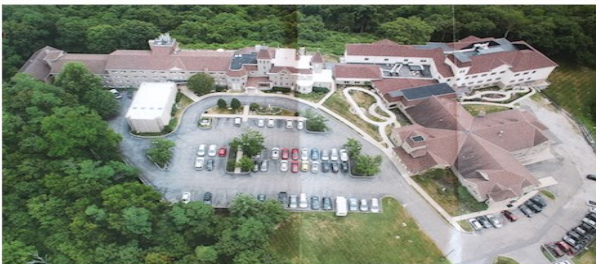
Bird's eye view of the grounds of Carmel Manor, 2018

The Carmelite Sisters were invited by the Diocese of Covington to establish Carmel Manor on the site of Kinney Estate in 1949. For the last seven decades, Carmel Manor has evolved to continuously meet the changing needs and expectations of the community.