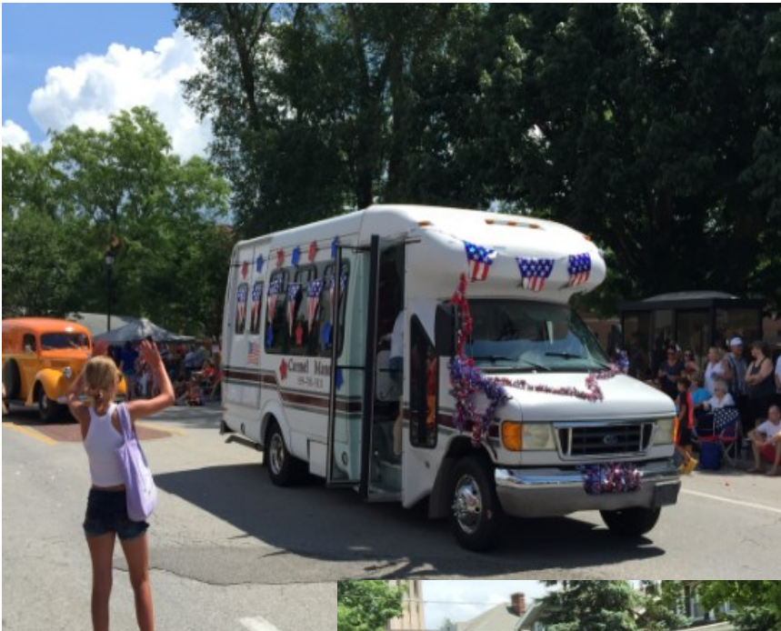
Fort Thomas 4th of July Parade